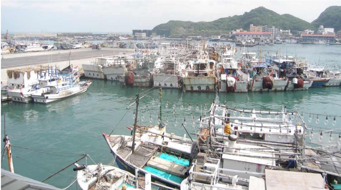
Figure 1: A typical minor fishing port in Taiwan

The recent EU yellow card has only led to increase in penalties for illegal fishing while other areas of concern have hardly improved to track compliance for the high seas fleet. It remains highly unlikely that heavy penalties will be imposed due to protectionist agenda (Anon, pers.comm. , 2016).